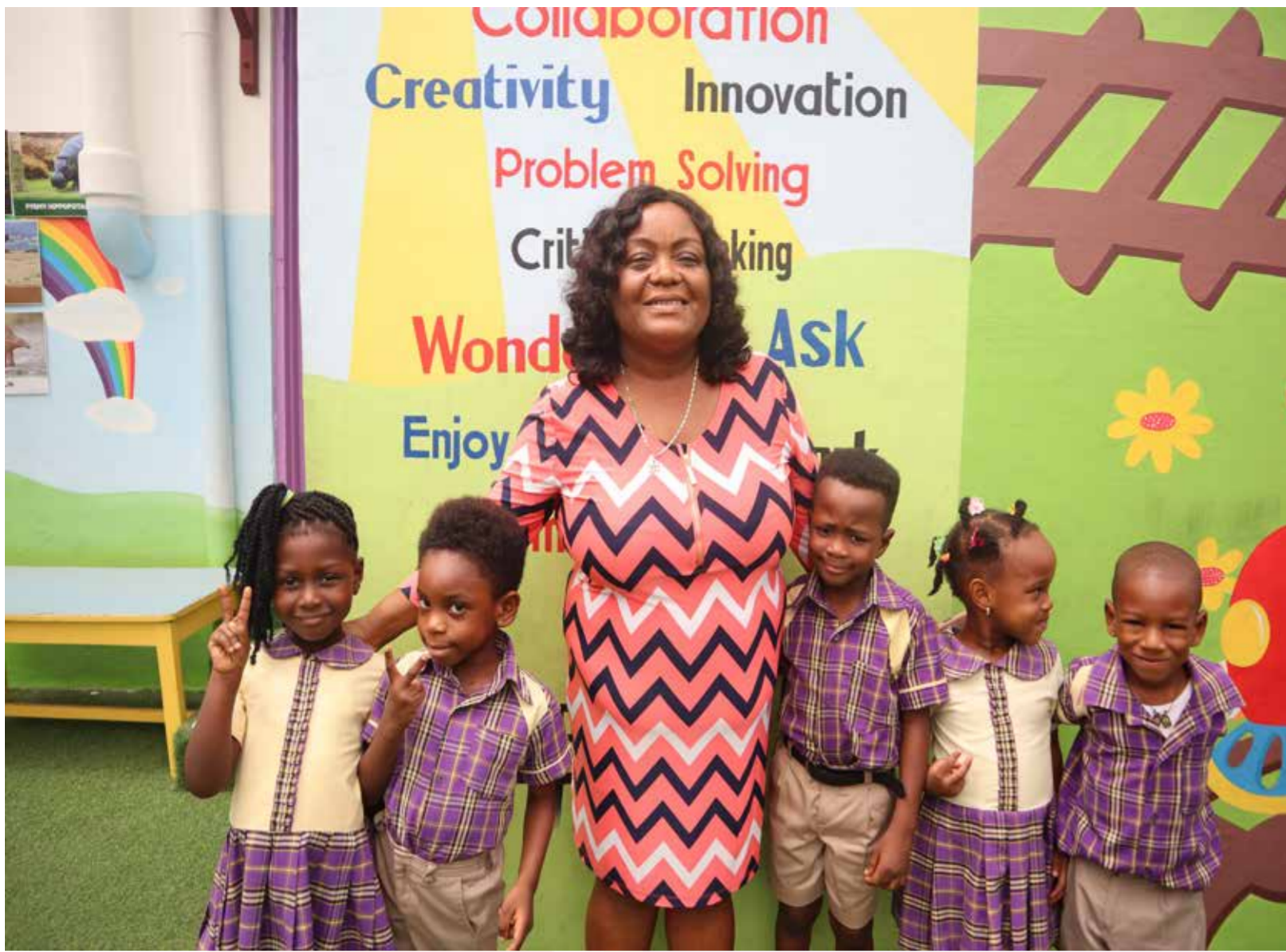
Early Years Campus (Osu - Ringway)