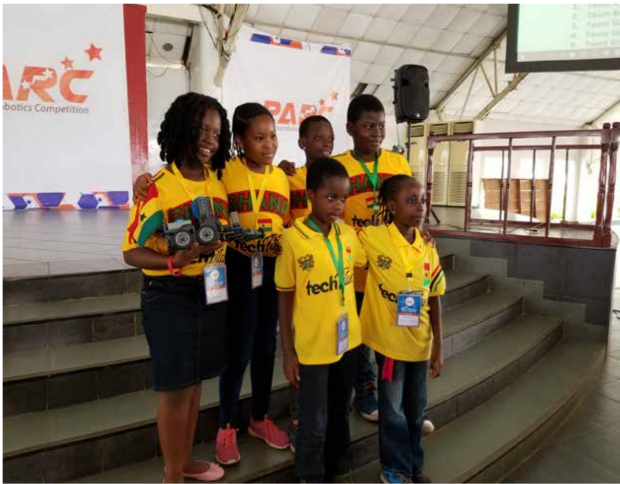
Robotics Fair 2019 3rd Place Champs