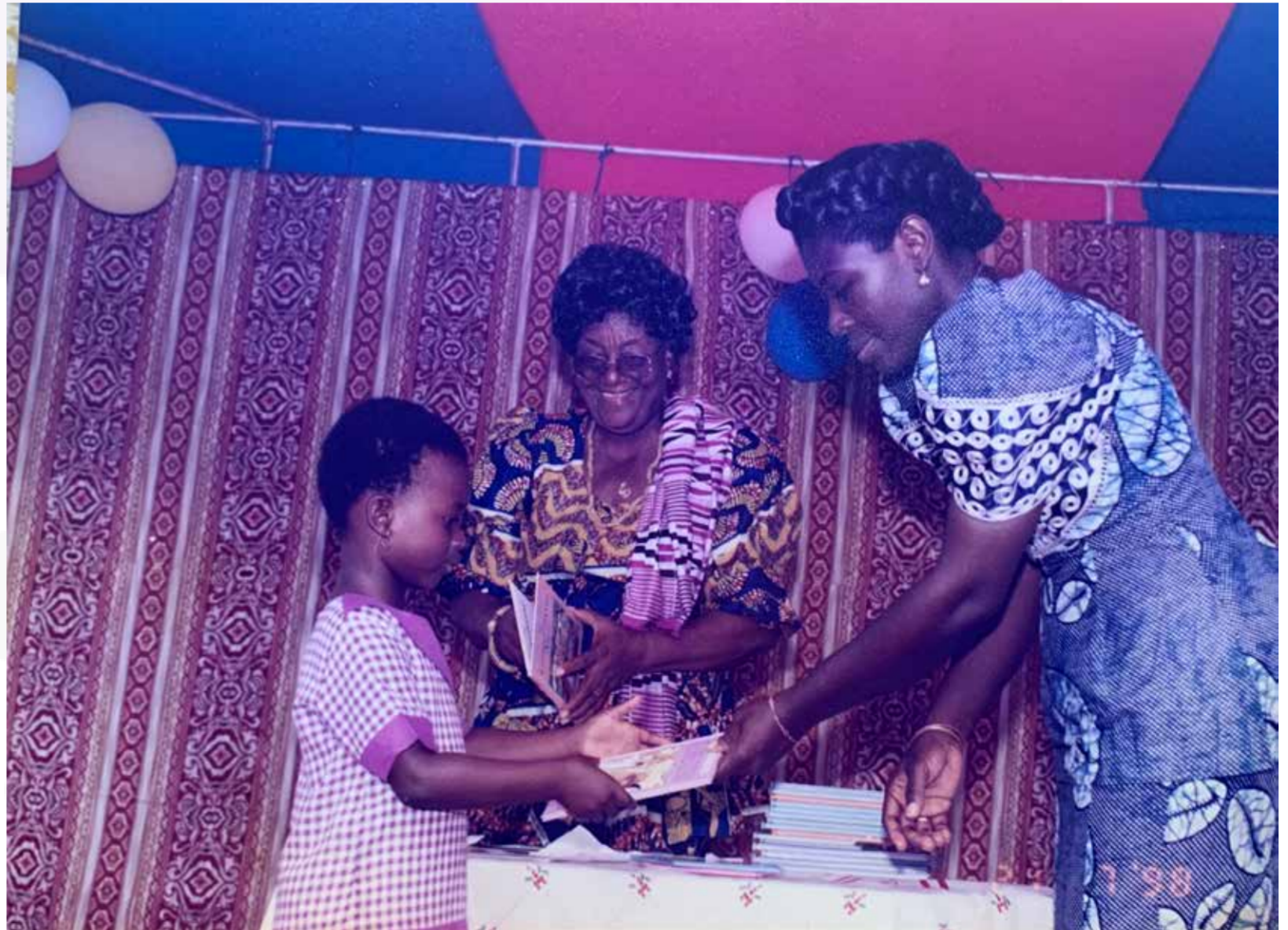
Learning Skills 1998 Graduation Ceremony