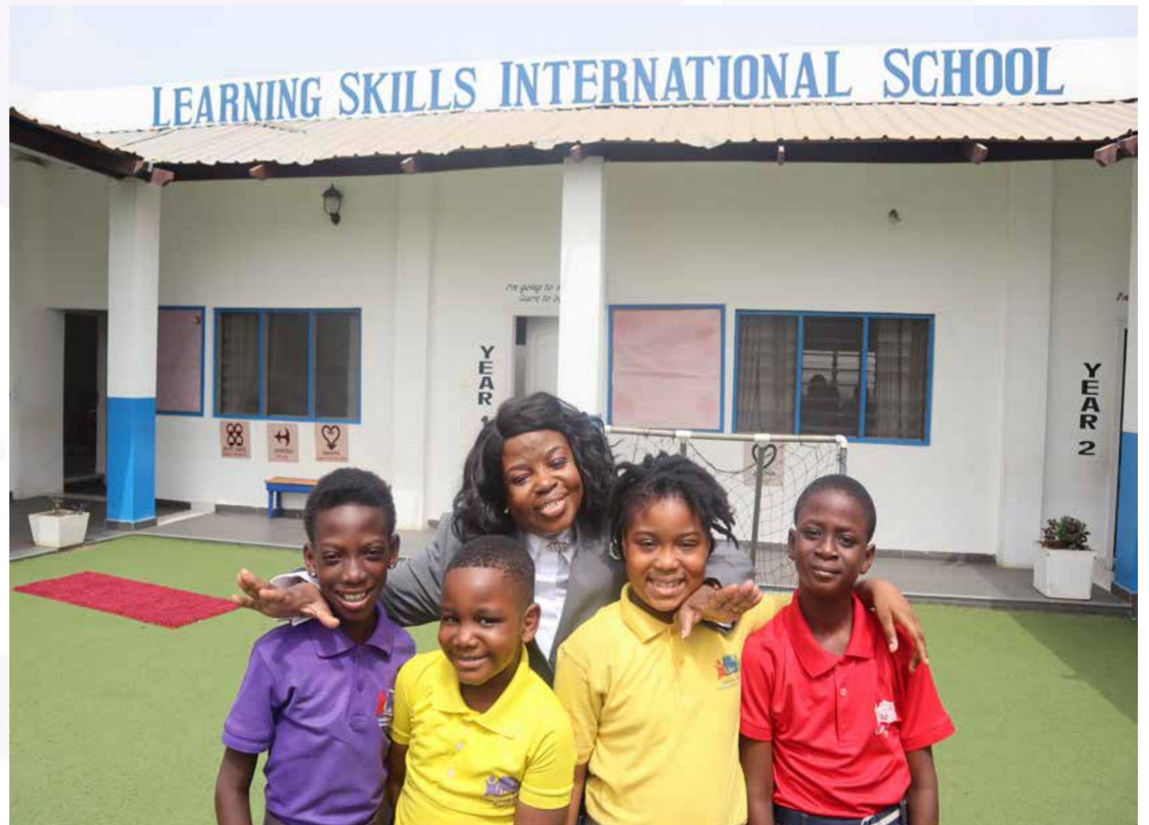
Primary Years Campus (Adjiringanor)