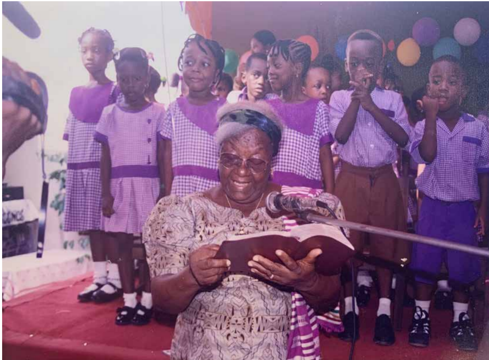
Learning Skills Circa 2000