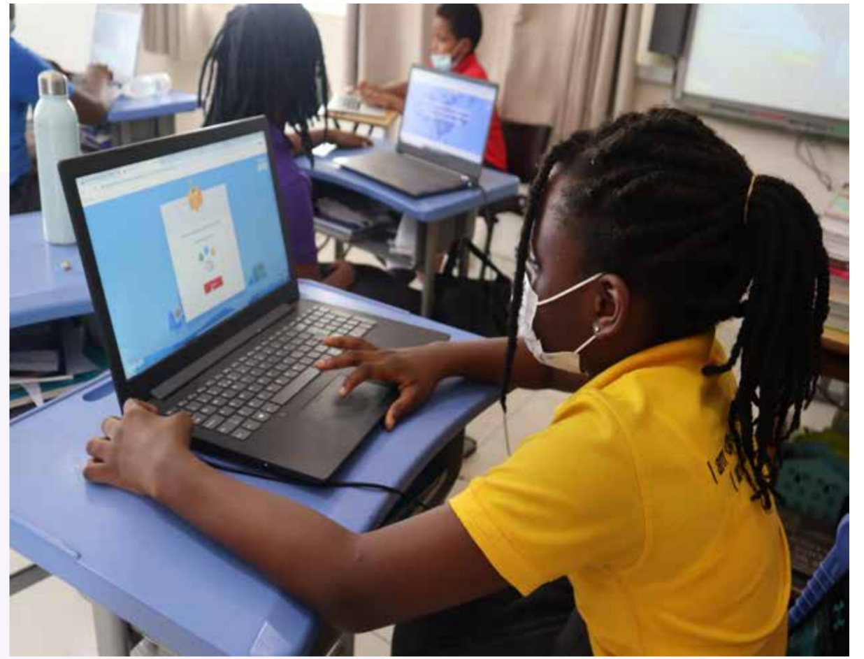
IT / Coding Class