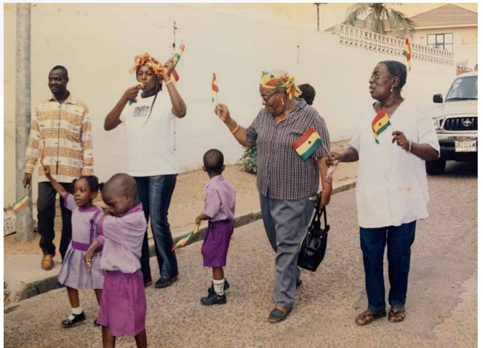
Learning Skills Celebrates Ghana @ 50 - Circa 2007